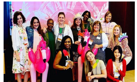
WE ALWAYS ENJOY A PHOTO-MOMENT THAT INVOLVES FLAMINGO PROPS