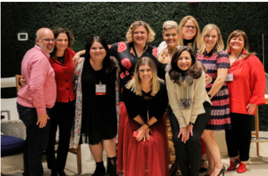
THE NEWH TEAM GATHERED AT THE GORGEOUS PALENTINE'S EVENT LOCATION, THE JANUS ET CIE SHOWROOM!