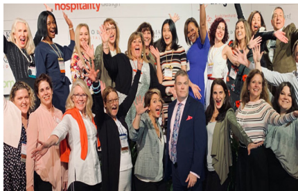
THE BOD REPRESENTING OUR CHAPTER AT THE NEWH LEADERSHIP CONFERENCE 2019 - MIAMI, FL

distribution, education, manufacturing, production, purchasing, and sales of the Hospitality, Foodservice, Senior Living and related industries. With this Newsletter, we hope to reach out to students and hospitality members that want to expand their network. In this two-page spread, you will find project installations, student scholarship winners, new product features, and more!